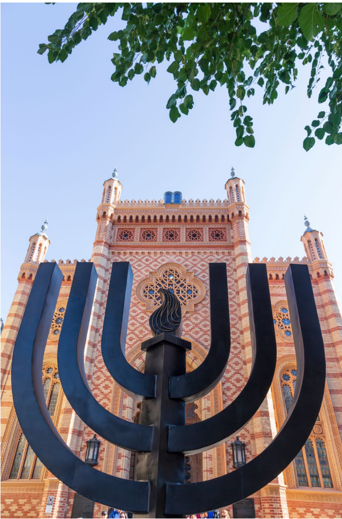
Romania, Bucharest, Choral Temple.