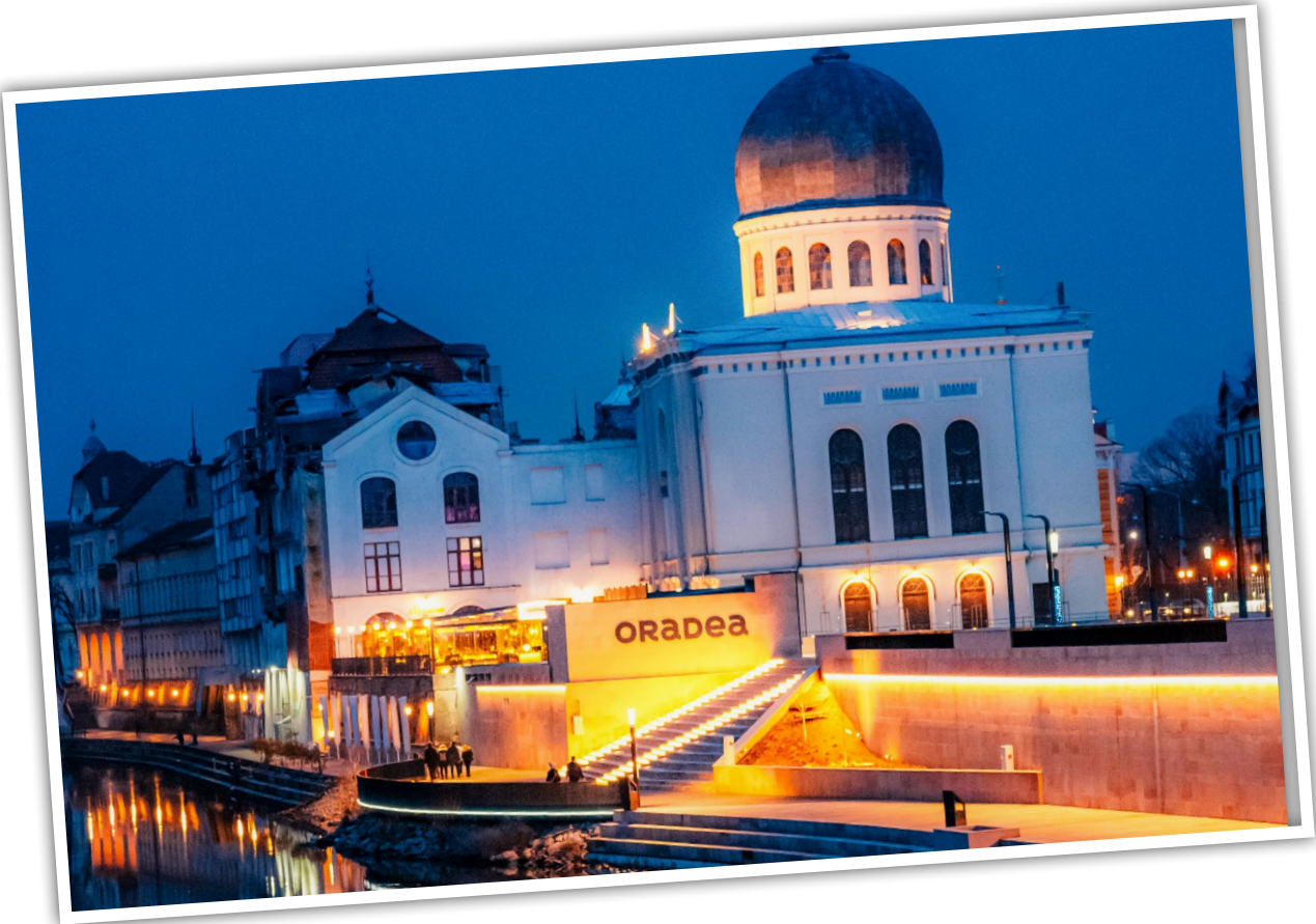
Zion Neolog Synagogue, Oradea Romania, in Western Transylvania

by a person rendering any of the services included in the tour. By agreeing to take part in this tour the participant agrees to hold APR, its principals, agents and assigns, harmless from any liability respecting APR's performance of its role on this tour. APR reserves the right to cancel or change aspects and inclusions in the tour, to change presenters, tour or operations staff, and to substitute comparable services, in its best judgment, without notice. APR in its reasoned judgment following consultation with tour leaders reserves the right to decline to accept or retain on the tour any participant should APR become aware that such person's health, behaviors or general deportment impede the