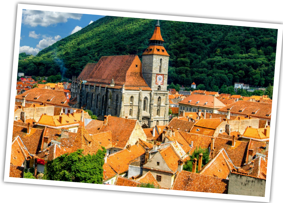
Brasov cityscape in Romania

intervention, security concerns or US State Department warnings against travel to the destination country(ies), participants remain subject to the above cancellation penalties and terms. Should APR determine it must cancel a departure for any of the listed reasons, or for another situation outside our control, we will make our best effort to obtain refunds from service providers, without guarantee. Travel insurance is, once again, highly recommended. Credit card fees, are non-refundable.