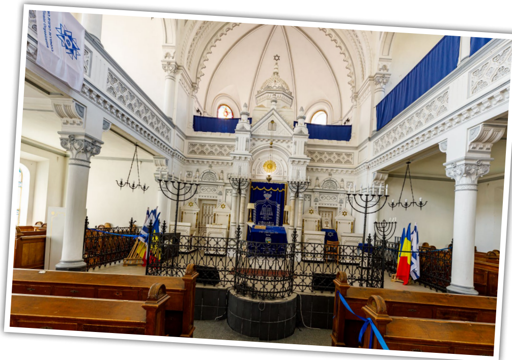
The Brasov Synagogue in Romania

by a companion capable of and totally responsible for providing such assistance. Please consult our staff as well as your physician. We like the “healthy travel” tips in this article: https://www.ricksteves.com/travel-tips/health/staying-healthy .