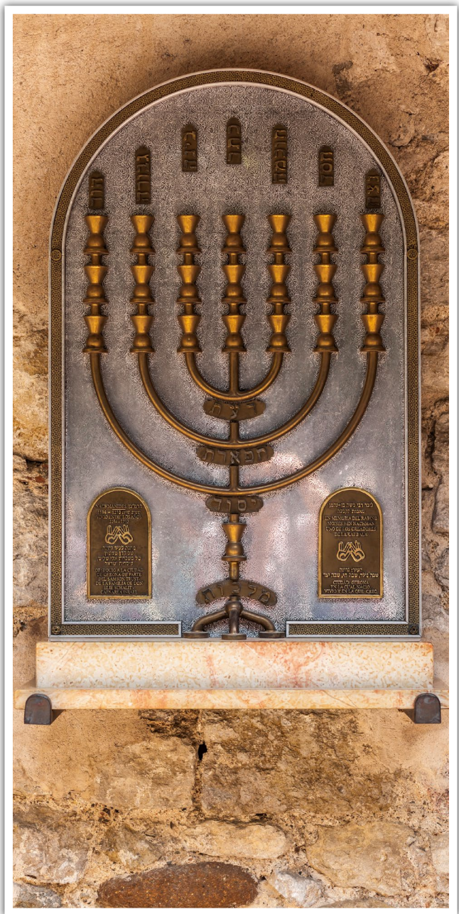
Menorah in Jewish museum

Tour organizer APR GROUP, INC. offers private customized pre- and post-trip visits to Prague, Vienna and elsewhere in Europe. For more information, contact APR at (415) 686-9672 or email moroccotravelgroup@gmail.com