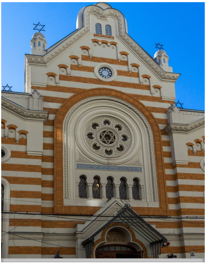
Museum of Jewish History in city of Bucharest, Romania