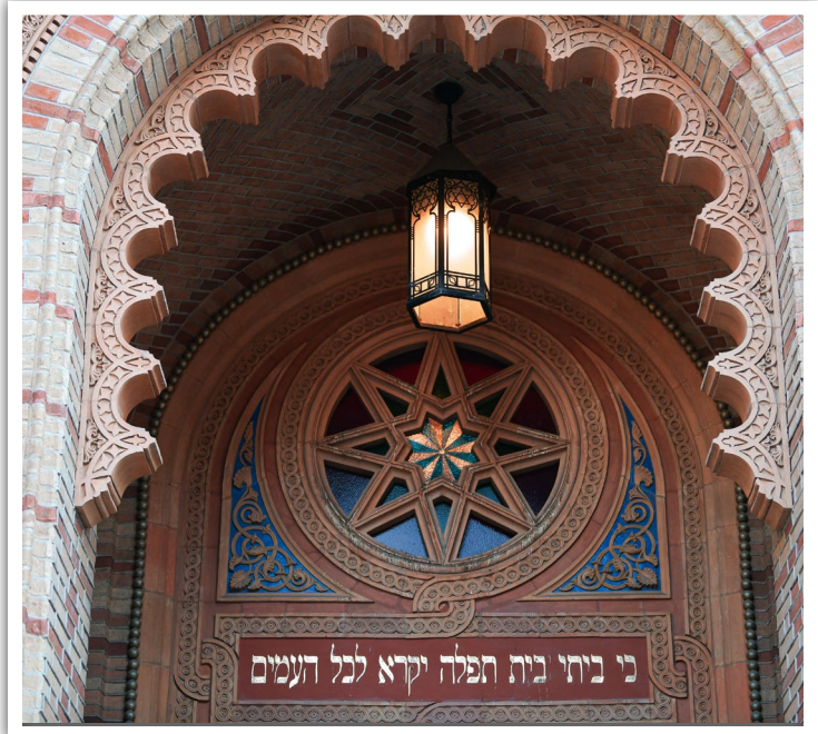
The Choral Temple synagogue building located in Bucharest